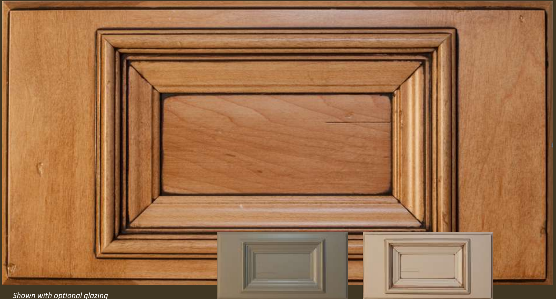
Shown with optional glazing