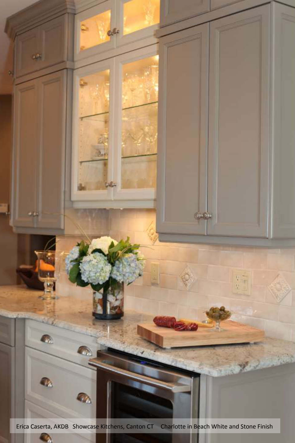
Erica Caserta, AKDB Showcase Kitchens, Canton CT Charlotte in Beach White and Stone Finish