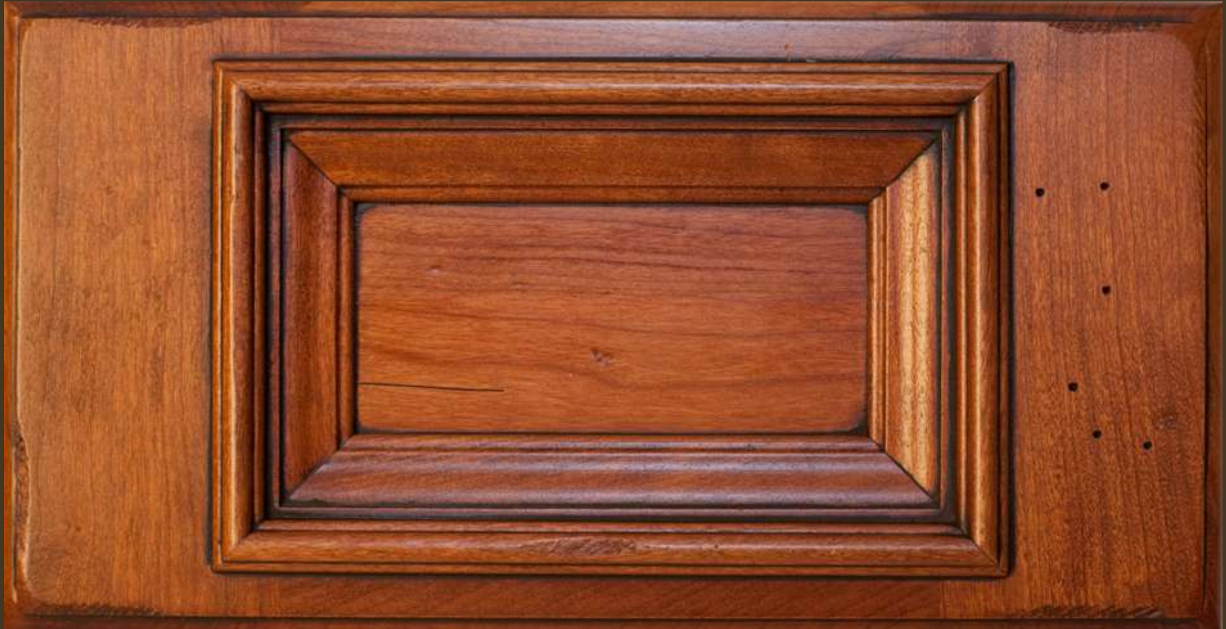
Shown with optional glazing