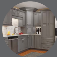
Kitchen & Bath

For a complete line of Wolf products, including these items and more, please visit our website.