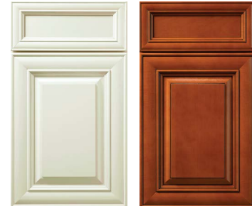
Antique White Paint Heritage Brown Stain with Chocolate Glaze