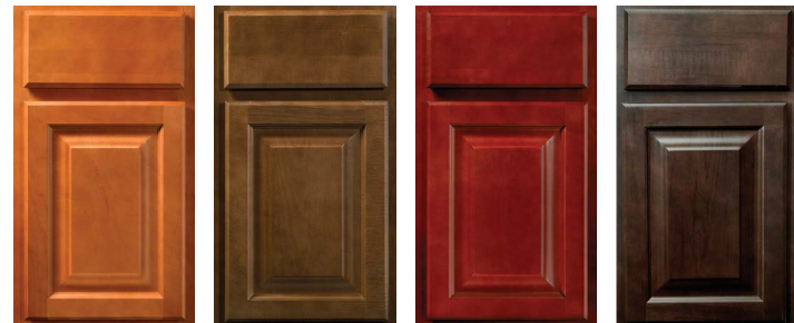
Honey Stain Chestnut Stain Crimson Stain Dark Sable Stain