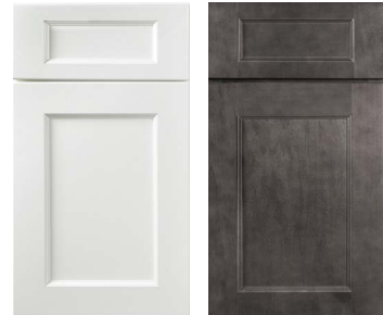
White Paint Grey Stain