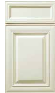
Antique White Paint