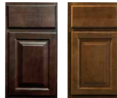
Dark Sable Stain Chestnut Stain