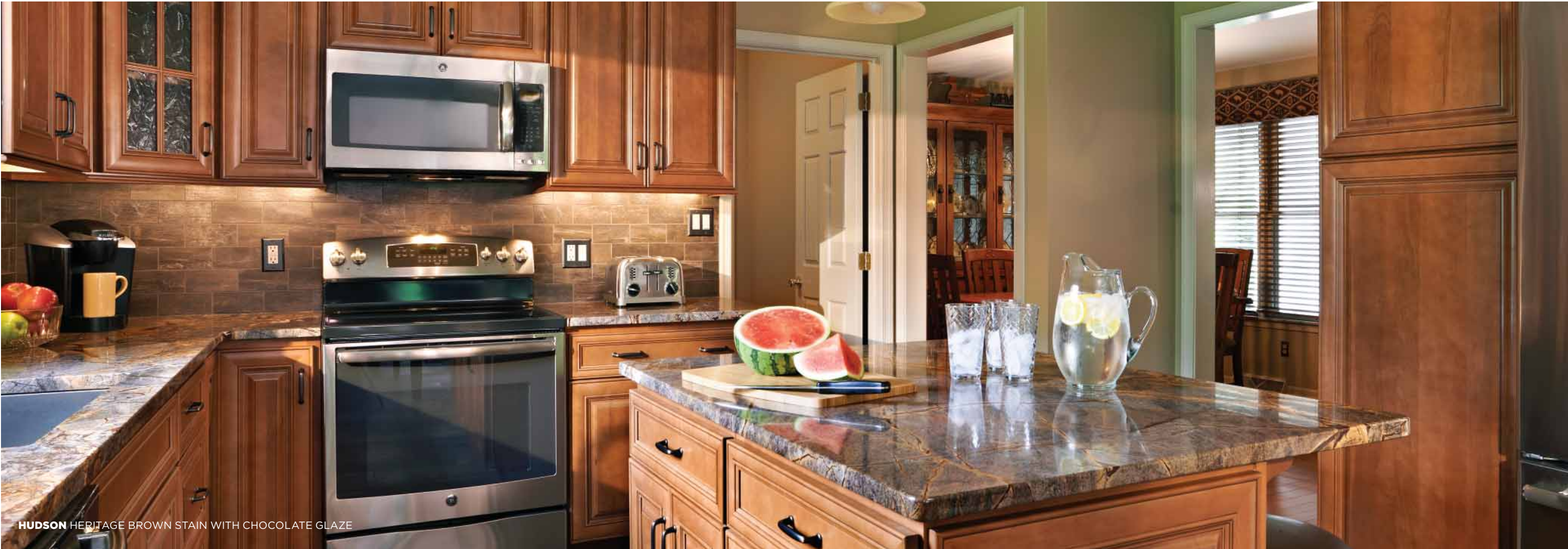
HUDSON HERITAGE BROWN STAIN WITH CHOCOLATE GLAZE