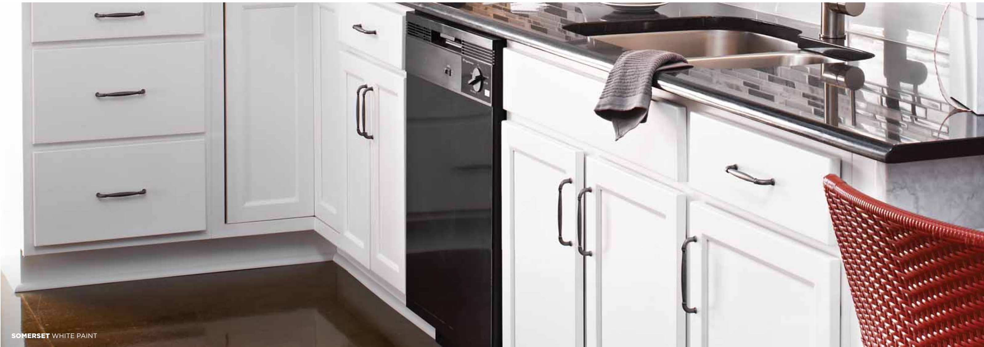
SOMERSET WHITE PAINT