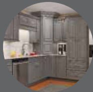
Kitchen & Bath

For a complete line of Wolf products, including these items and more, please visit our website.