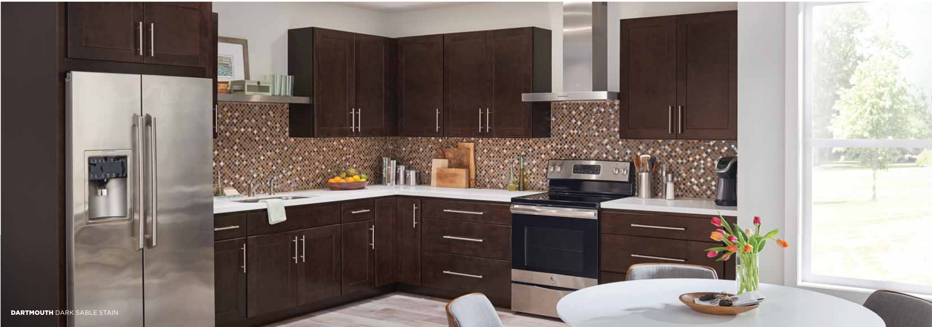
DARTMOUTH DARK SABLE STAIN