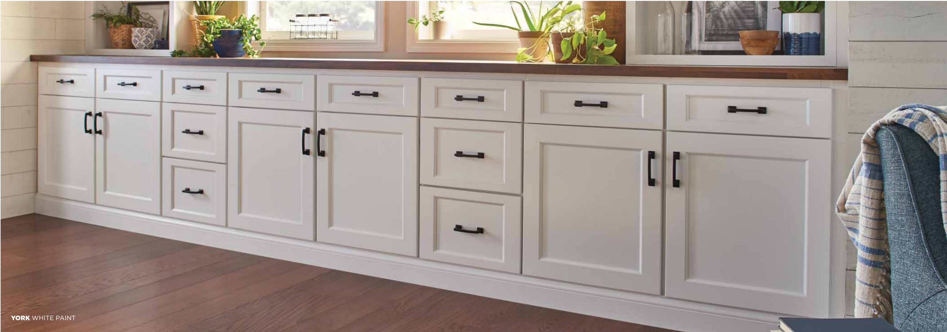
YORK WHITE PAINT